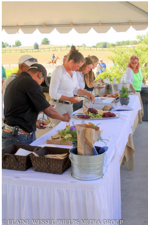
Wine and Cheese Party, sponsored by North Peak Brewery.